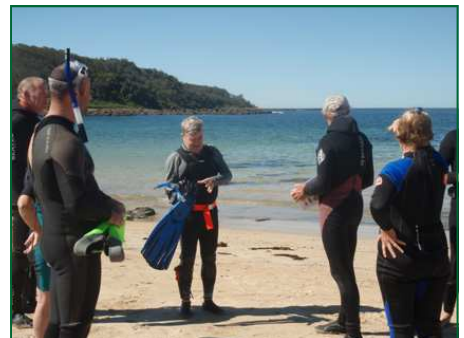
Snorkelers at Broulee (above)