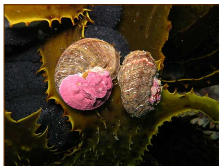
The mollusc, Turbo torquatus, on the brown seaweed, Ecklonia radiata (pic taken at Bogola Head south of Narooma). Both of these species are targets for our snorkel surveys. Notice how a pink encrusting alga has attached itself to the shell of the mollusc. A hard surface is heaven for many marine species trying to find a home.